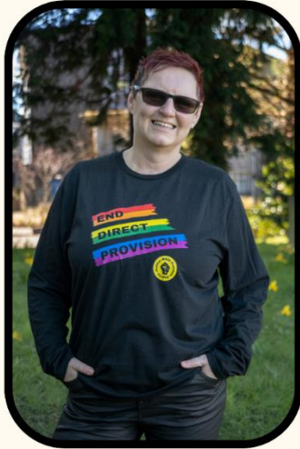
Lionra LADTA+ #iCount